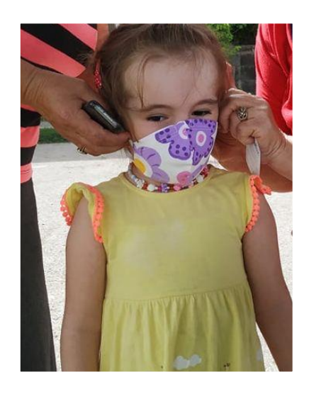
A refugee girl at a social house, Darbnik village