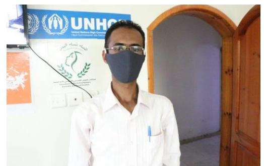
A sample face mask produced by the IDP and refugee tailors during the training course as part of the COVID-19 resilience building livelihoods project.

Special thanks to our major donors: Thani Bin Abdullah Bin Thani Al-Thani Humanitarian Fund | United States of America | Country-based pooled funds | United Kingdom | Japan | Qatar charity | France | Switzerland | Kuwait Society for Relief | Sheikh Eid Bin Mohammad Al Thani Charitable Foundation | Canada | Private Donors Lebanon .