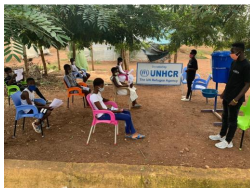
Some refugee school children in Fetentaa Camp educating their peers about how to protect themselves from covid-19