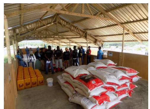
One-time food donation by UNHCR to refugees to mark World Refugee Day. Pix from Egeyikrom