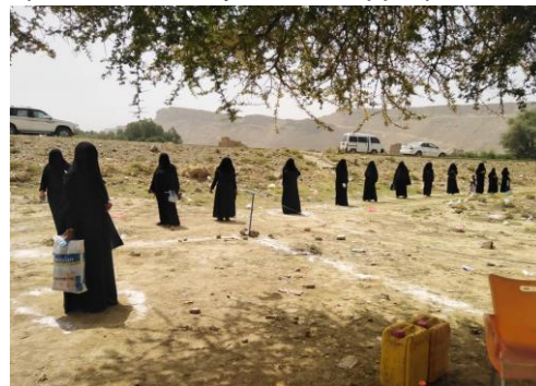
Displaced women are queuing up for while keeping social distance at a distribution of basic household items in Sahar district, Sa'ada Governorate, north of Yemen.

Somali community leaders referred 51 Somali refugees to UNHCR who had been forcibly relocated to the south from the border cities with KSA. UNHCR is following up to ensure they receive appropriate assistance, including registration support. Rapid protection assessments showed that food and shelter remained their most pressing needs. Overall, some 286 Somali refugees have arrived in the south from De Facto Authority-controlled areas in recent months in the wake of the pandemic. Many have reported stigmatization and discrimination based on the unfounded belief that their displacement status is spreading COVID-19. UNHCR assisted with registration, documentation, COVID-19 awareness, and cash assistance to help with their most urgent needs, including food and shelter.