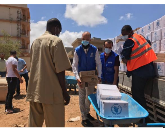
UNHCR and WFP providing food parcels to last for one month at UNHCR's Serraj Registration Office.

As World Refugee Day (20 June) draws near, UNHCR held several days of art workshops at a shelter