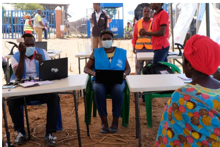
UNHCR staff in Kyaka II refugee settlement, Uganda, ensuring that food and CRI distribution modalities are carried out accordingly.

The focus remains on strengthening primary health care facilities in camps while advocating for persons of concern to be included in national response plans. We have, however, identified a number of refugee camps and settlements in Ethiopia, South Sudan and Sudan where refugees are too far from referral hospitals and we will therefore need to establish that secondary health support is possible. Isolation centres have been developed and continue to be identified as part of the preparedness and response plans in country operations. In Burundi , the rehabilitation and expansion of 7 isolation centers across the camps and transit centers is under way. In West Wollega, Ethiopia , 6 isolation centers were established to cover IDP areas. This past week, UNHCR Tanzania donated 40 beds and mattresses to Kibondo and Kakonko districts to support the set up of isolation and treatment facilities at the district level and completed the set-up of an additional 5 tents for isolation of suspected cases in Mtendeli camp. Water connection and WASH facilities were also put in place. Training of frontline workers to respond to COVID-19 is ongoing and countries have adopted various training modalities, including webinars and online courses in coordination with respective Ministries of Health.