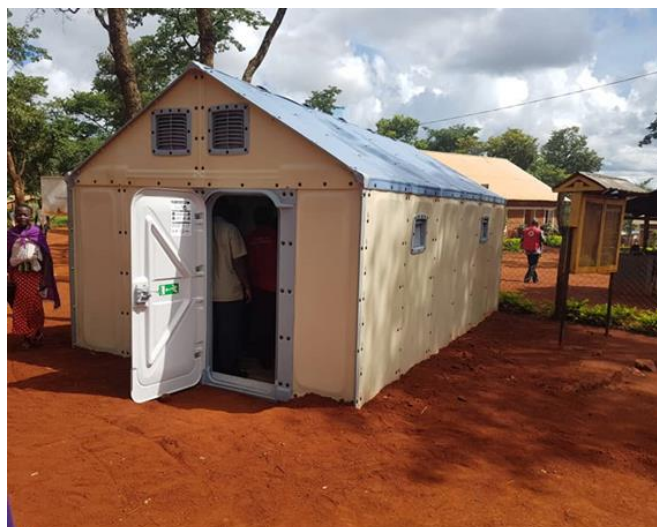
Screening room in Nyarugusu camp, Tanzania.

UNHCR remains actively involved across the region with Ministries of Health on the inclusion of refugees in national preparedness and response plans to combat COVID-19. Securing medical supplies and personal protective equipment (PPEs) has proven challenging for several operations putting staff and persons of concern at risk. Given the anticipated delays in receiving medical supplies through international procurement, countries are also seeking to procure PPEs locally while waiting for the international supply. This includes sourcing from the UN-AU solidarity flights that are being dispatched to countries across Africa.