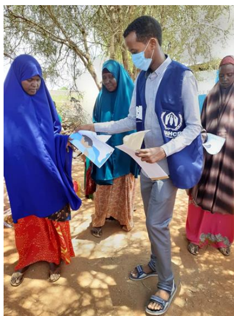
Sensitization campaigns in IDP settlements in Baidoa, Somalia.

At the regional level UNHCR is engaged with the Regional Humanitarian Partners Team to map the impact on humanitarian operations and coordinate on advocacy messaging, as well as with many sectoral groups including health, nutrition, education, and child protection which have been developing context specific inter-agency guidance on programming during the COVID-19 pandemic.