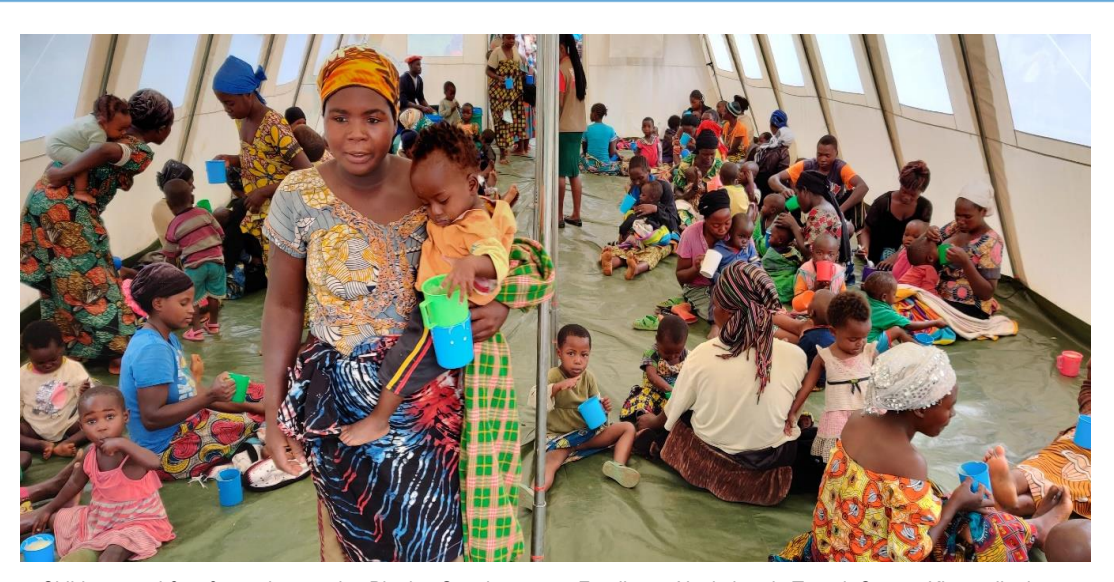
Children aged 6 - 59 months, receive Blanket Supplementary Feeding at Nyakabande Transit Centre, Kisoro district, in early 2020.