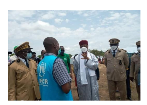
Pic 1; During visit to the East region, the Secretary of State in the Ministry of Public Health assessing UNHCR's measures to protect PoCs against the spread of Covid-