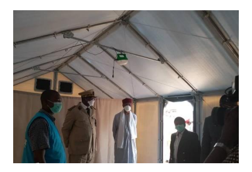
Pic 2; Secretary of State in the Ministry of Public Health visits one of the RHUs being set up in the Gado site.