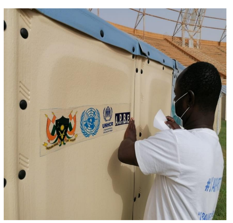
One of over 400 Refugee Housing Units donated by UNHCR to serve as emergency medical facilities and isolation units in Niger.

In the Sahel, sexual and gender-based violence is endemic and includes widespread abuse and exploitation, trafficking, forced and early marriage, unwanted pregnancy, and increasing instances of rape and other forms of sexual violence as the conflict exacerbates, etc. This dramatic situation is now further aggravated by the spread of COVID-19 which is expected to disproportionately impact women and girls traditionally caring for sick family members and being exposed to negative family coping mechanisms like child marriage in times of crisis.