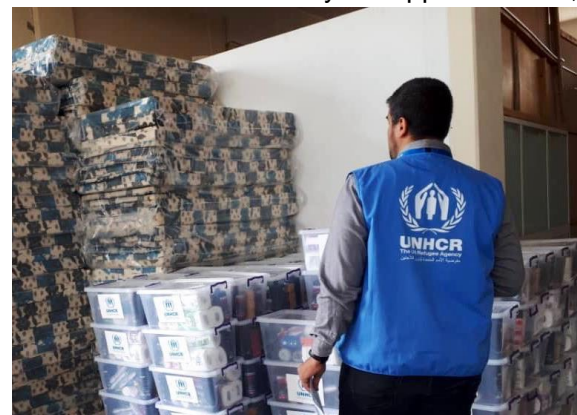
UNHCR distribution of CRIs in Misrata.

As part of UNHCR COVID-19 interventions in Eastern Libya, UNHCR's partner, LibAid, has started distribution of UNHCR soap to Benghazi camps, hosting internally displaced persons (IDPs). The plan is to reach all IDP settlements in the East with more than 20,000 bars of soap (two per individual). On 21 April, 437 IDPs