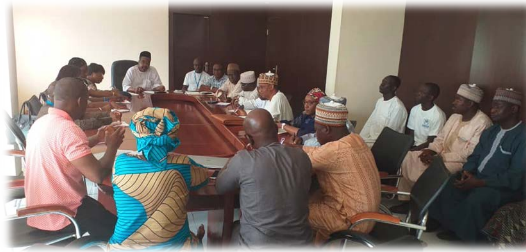
In Session with the Technical Working Group