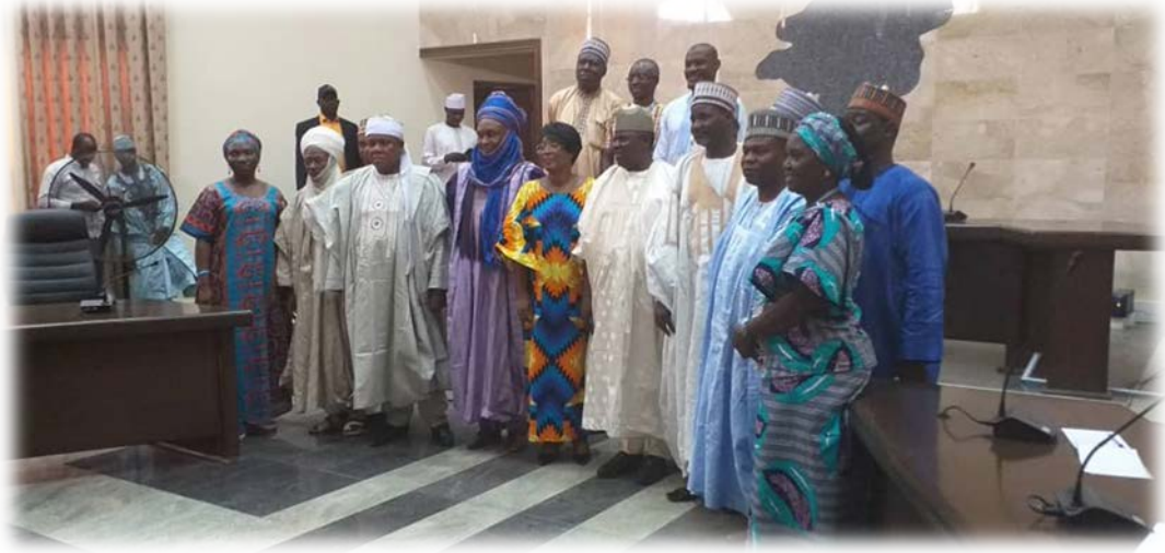
@ Government House, Yola