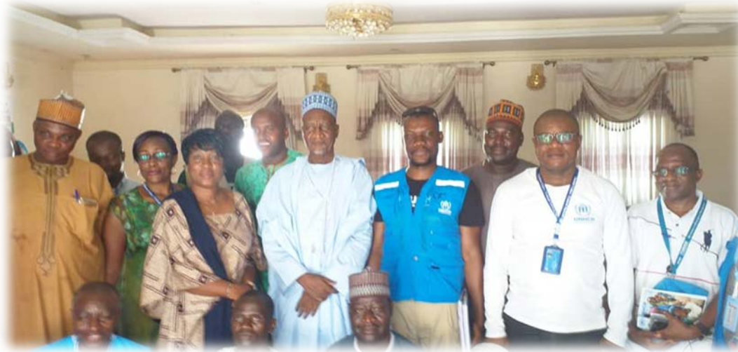
With the Emir of Mubi