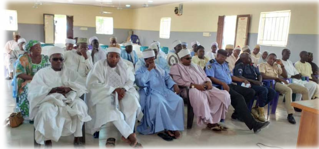
Cross Section of Traditional Leaders @ Gombi