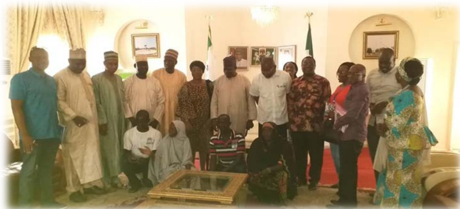
Delegation with Adamawa State Deputy Governor