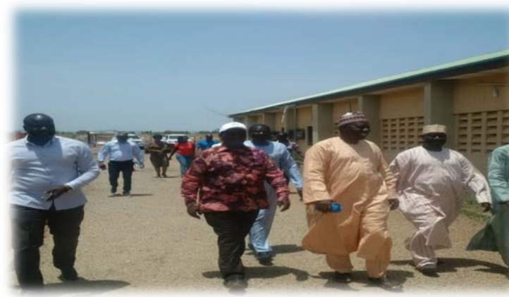
Facility Inspection – Reception Centre