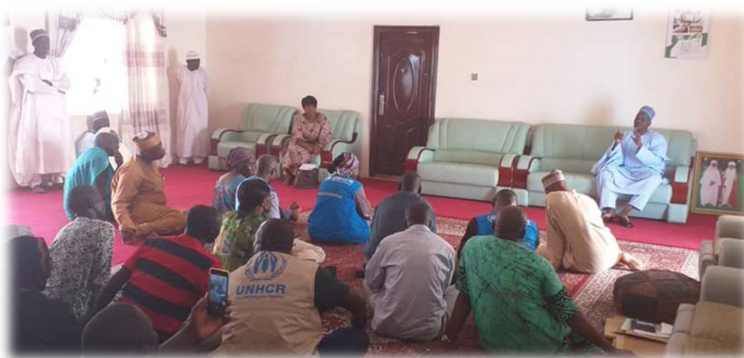
@ Mubi Emirate Council