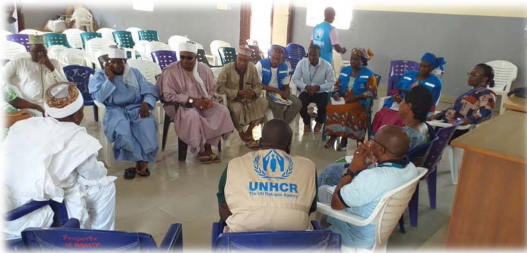
Closed Session with Traditional Leaders