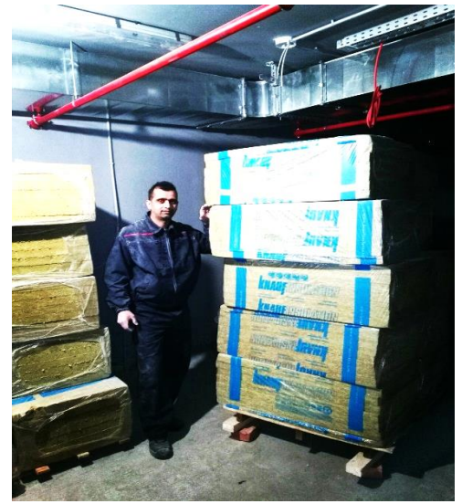
Notwithstanding the COVID-19 situation, UNHCR assisted this refugee to secure employment with a reputable construction company, ©UNHCR, March 2020