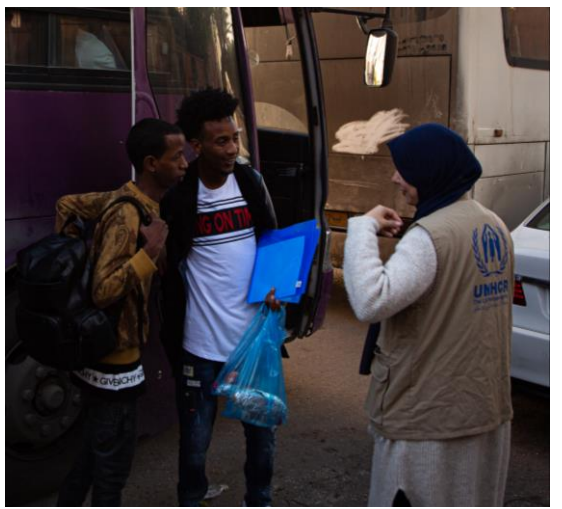
Evacuation of vulnerable refugees from Libya to the ETM in Niger.

On 12 March, UNHCR evacuated a total of 128 vulnerable refugees and asylum-seekers from Tripoli the Emergency Transit to Mechanism (ETM) in Niger. The group who comprised 103 men. 12 women and 13 children included refugees living in urban areas of Tripoli and others recently released from detention. UNHCR continues to urgently call on the international community provide to more humanitarian corridors and resettlement slots to transfer vulnerable individuals out of harm's way in Libya. So far this year, UNHCR has transferred 289 individuals to third countries.