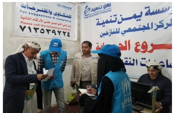
UNHCR staff monitor the distribution of multi-purpose cash assistance and rental subsidies to displaced people in Sa'ada.

In northern governorates of Yemen, through its first round of cash transfers in 2019, UNHCR is disbursing some USD 5 million, to around 29,000 IDP families – an estimated 203,000 individuals. Cash transfers are made to households in need of support to meet their protection needs or basic needs, or to help ensure that they have adequate shelter, including capacity to cope with the current winter conditions.