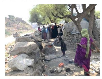
An inter-agency mission took place to Maqbanah district, north of Taizz governorate. © UNHCR/ Fatimah Al-Sowaidi.

An Inter-Agency mission alongside OCHA and WFP took place in Maqbanah district, central-north of Taizz governorate. This area is one of the hard-to-reach areas, divided by an active frontline, with most of its 262,400 residents in acute need, including some 3,000 IDPs. The IDP families have typically fled from nearby districts in the same governorate or the neighbouring Hudaydah governorate. Some IDP families were sheltering in an unfinished school, but have been informed by local authorities that they should vacate soon, so that students can resume classes. UNHCR is coordinating with the NFI/Shelter Cluster partners to help secure them alternative accommodation.