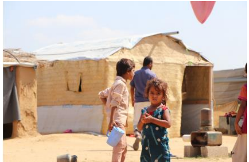
A girl stands in front of her newly installed TESK in Az Zuhra district, north of Hudaydah governorate. UNHCR plans to install a total of 3,000 TESKs in this district, incorporating locally produced materials as part of income generating activities.

As part of income-generating activities and livelihoods support for IDPs and vulnerable host communities, UNHCR partner Jeel Al-Bena signed a contract with local industries in Al-Jarahi district, Hudaydah, to train 100 selected IDP and vulnerable host community members (50 males and 50 females) for a period of one month. The training will enable participants to produce Khazaf , a woven banana leaf layer that forms part of the Tehama Emergency Shelter Kits (TESKs), that help withstand against the hot and humid conditions.