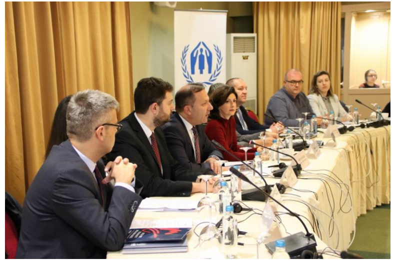
Future challenges in migration management conference organized by partner organization Macedonian Young Lawyers Association 27 November 2019, Skopje

1 Representation Office in Skopje, with daily field presence in Tabanovce, and 1 Field Unit in Vinojug Reception and Transit Centres