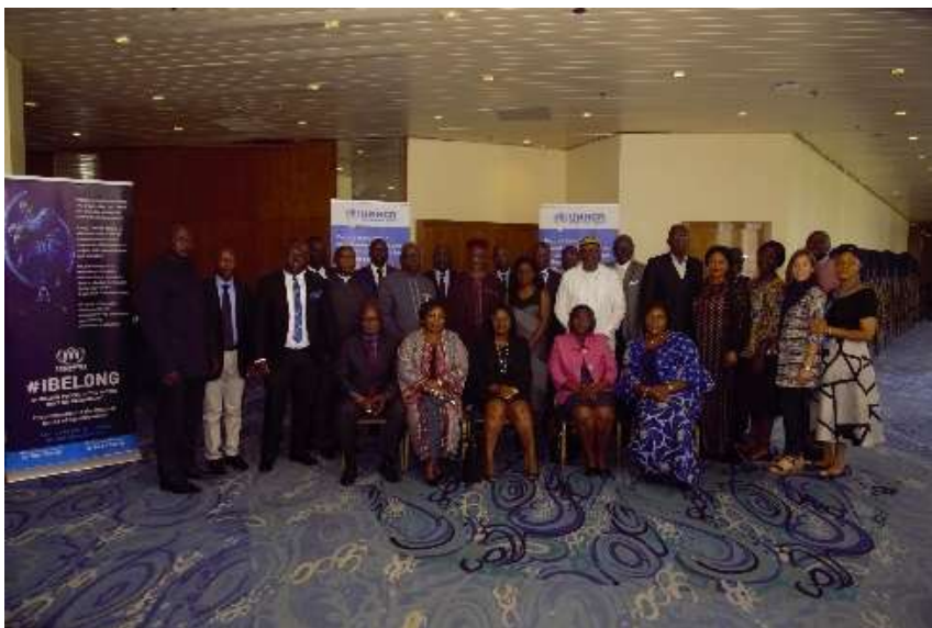
Group picture: Interactive Session participants.