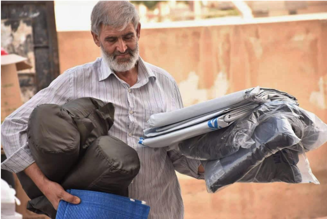
UNHCR's NFI distribution in Hassakeh