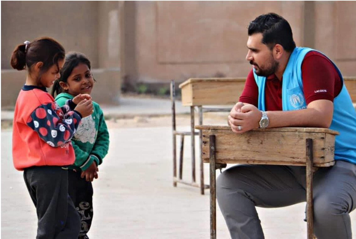
UNHCR is on the ground meeting with newly displaced children that are at a school, being used as collective shelter in Hassakeh.