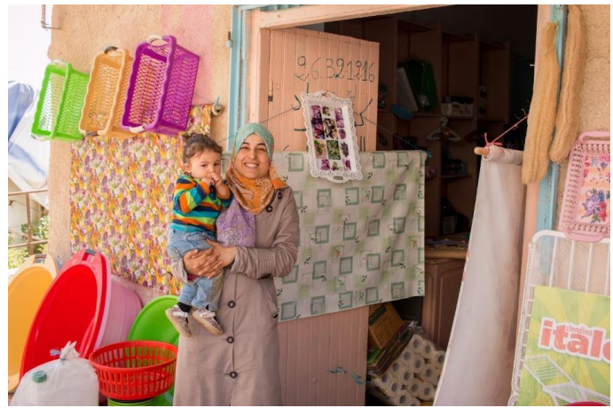
Syrian refugee set up her own business in Nabeul thanks to livelihood programme carried out with UNHCR partner ADRA in 2018