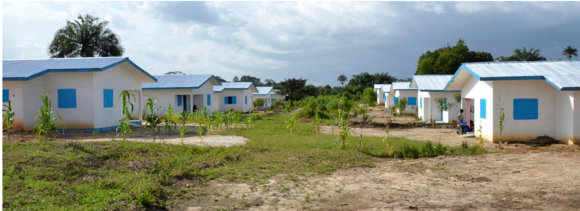
Some of the 13 durable shelter housing units handed over on 11 September 2019 in Bahn Settlement (Nimba County).