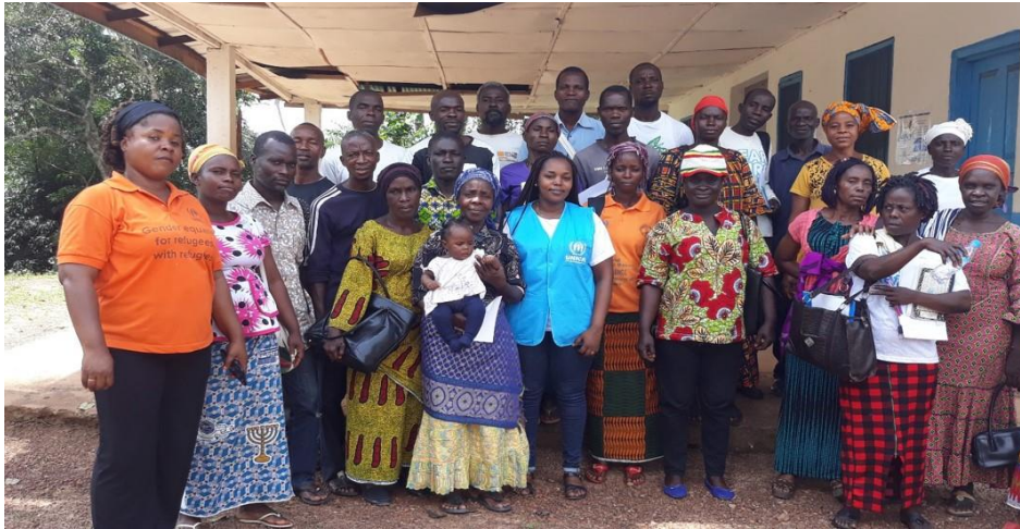
Participants of the Small Business Management Training (SMBT) in PTP Settlement (Grand Gedeh County).