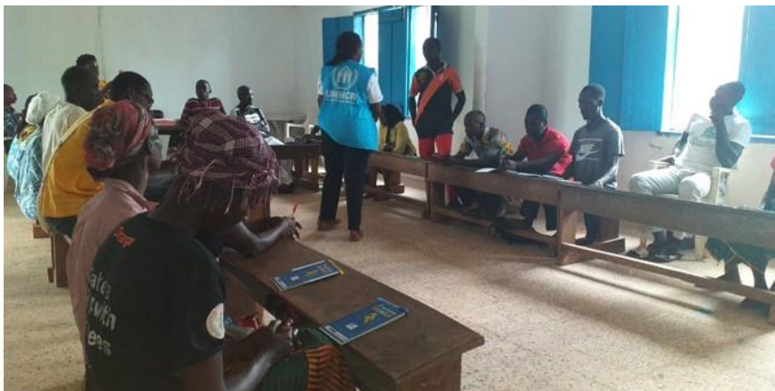
Participants of the Small Business Management Training (SMBT) in PTP Settlement (Grand Gedeh County).

In addition, UNHCR's operational partner CARITAS has begun livelihoods activities in PTP Settlement, including the selection of 150 female-headed households to start an 18-month livelihoods programme. Livelihoods activities currently ongoing in the settlement include agriculture and the running of fish ponds, poultry and piggeries