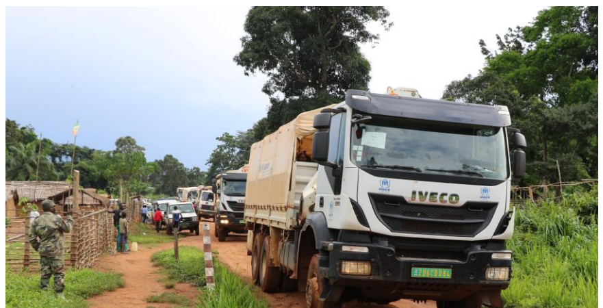
A convoy carrying refugees is crossing the border, moving to CAR.