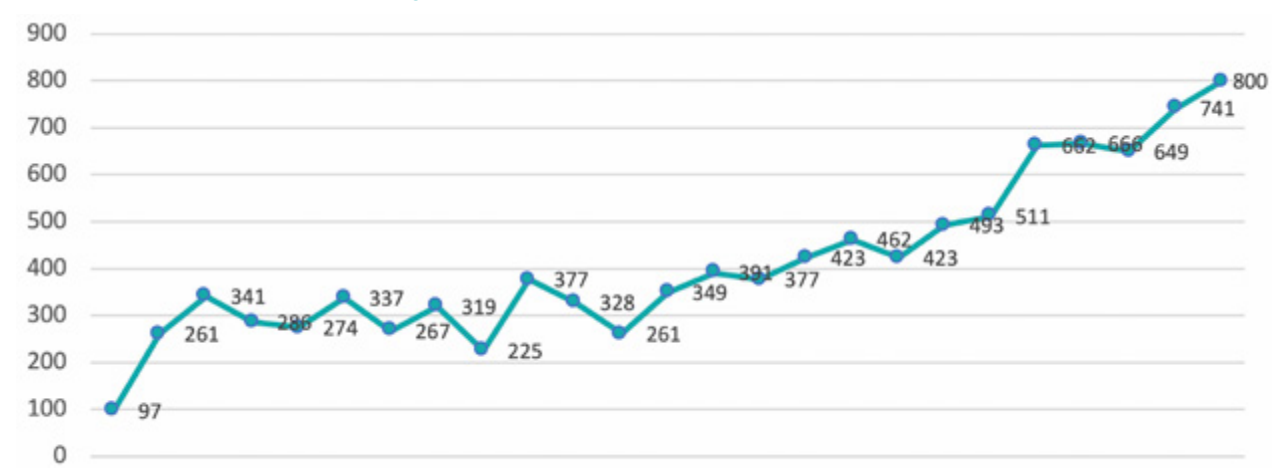
CEBAF Tumbes - Peru entries from August 1 to 25, 2019

Between August 1 and 25, 2019, more than 10,300 Venezuelans entered Peru through the border points with Ecuador. The average influx remained around 400 people a day. Ten days prior to entry into force of the visa requirements, it increased, averaging 800 people daily.