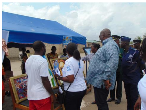
Ghana's Deputy Interior Minister visiting exhibition stands mounted by refugees during World Refugee Day

01 Country Office in Accra 01 Field Office in Takoradi