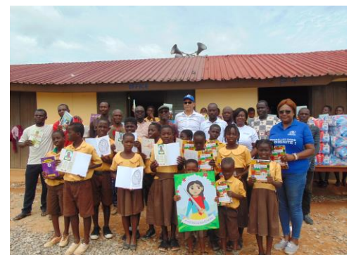
Charge d'Affaires of the Embassy of Peru a.i as they presented branded books to Egyekrom children