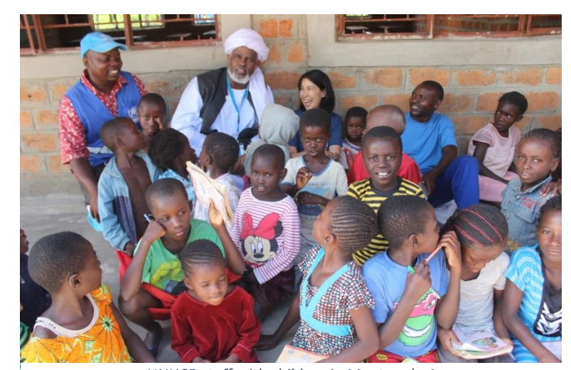
UNHCR staff with children in Mantapala A