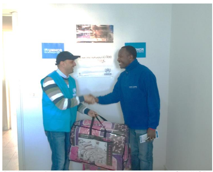
Distribution of non-food items during the winter season