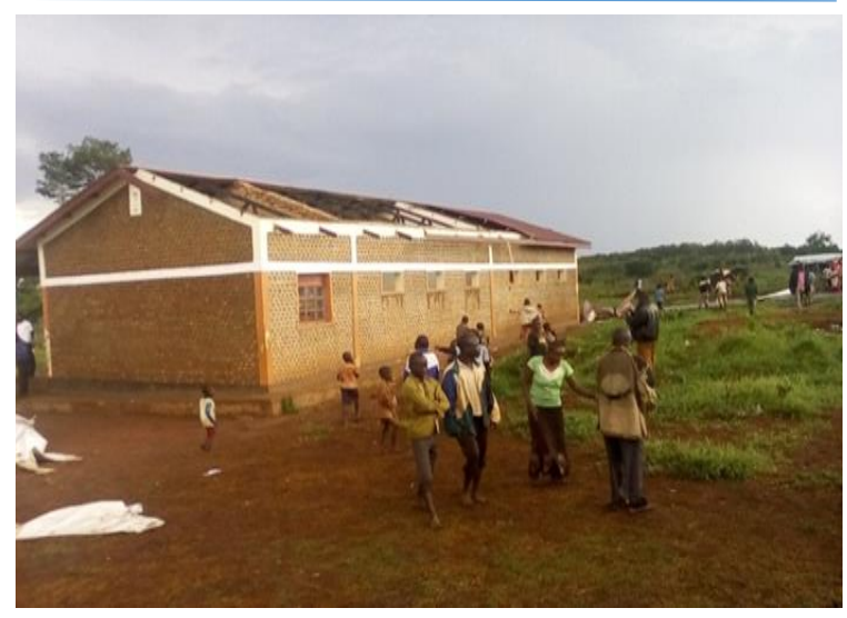
Storms caused the roof of Kinakyeitaka Primary School in Kyangwali to be blown off.