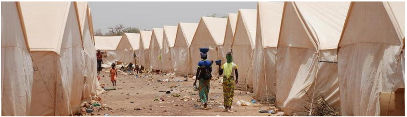
Barsalogho IDP site