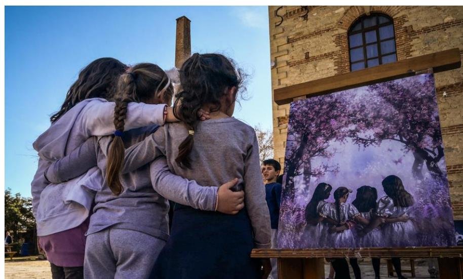
UNHCR-supported school festival bringing together Greek and refugee pupils.

4 Field Units in Evros, Ioannina, Leros, Rhodes