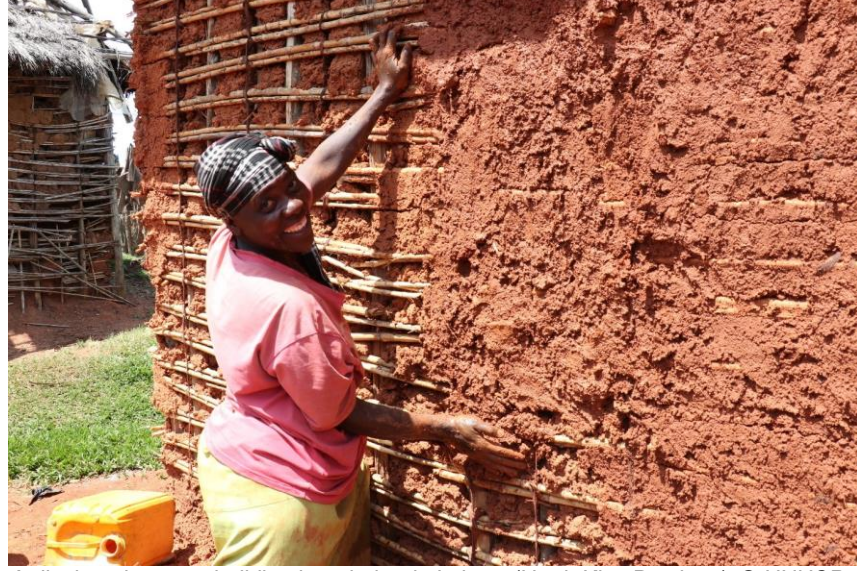
A displaced woman building her shelter in Lubero (North Kivu Province).