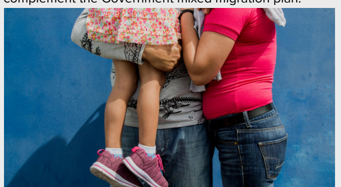
A family from Nicaragua wait to file their asylum application at the immigration office in San Jose, Costa Rica.

Since April 2018, more than 55,000 fled to Costa Rica. UNHCR is developing an inter-agency Emergency Response Plan to provide emergency relief to Nicaraguan asylum seekers and their host communities, which will complement the Government mixed migration plan.