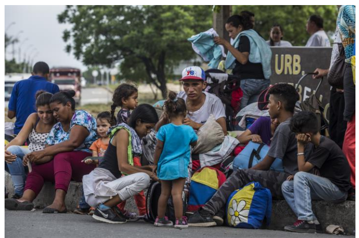
Cúcuta, border of Colombia with Venezuela. A family waits along the road before starting to walk to their next destination after fleeing Venezuela.

While some Venezuelans have obtained documentation which allows them to stay legally, the majority have no regular status, and are therefore more vulnerable to exploitation, abuse, violence, trafficking and discrimination.