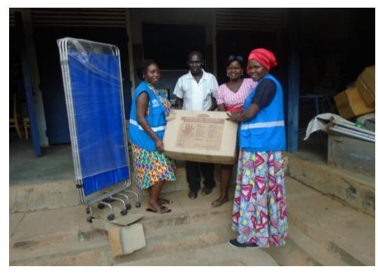
LWF SGBV Team handing over equipment to Hospital Management