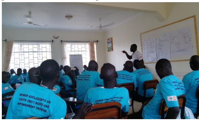
The MAGs/RMMBs during the training session

Following allegations of sexual harassment of students identified during the 2018 AGDM exercise, a meeting was held with 25 head teachers,