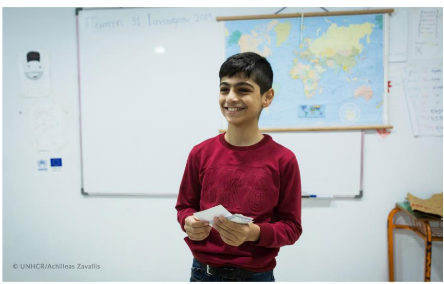
Refugee children attend UNHCR's non-formal school on Kos island.