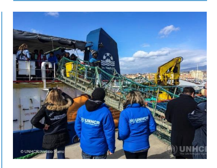
UNHCR staff prepares to meet passengers disembarking the Sea Watch 3 vessel in the Sicilian port of Catania on 31 January 2019