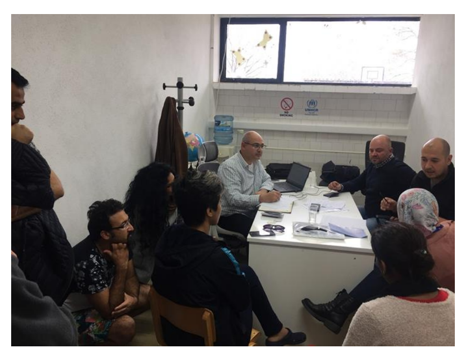
UNHCR and legal partner staff counselling residents of the Reception/Transit Centre Bujanovac on asylum procedures in Serbia, Bujanovac, 22 November 2018