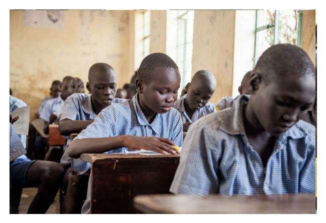
Refugee and host community learners at Kalobeyei Settlement Primary school attend a mathematics lesson. Refugee learners have in the past three years emerged among the best students countrywide in the Kenyan national examinations.