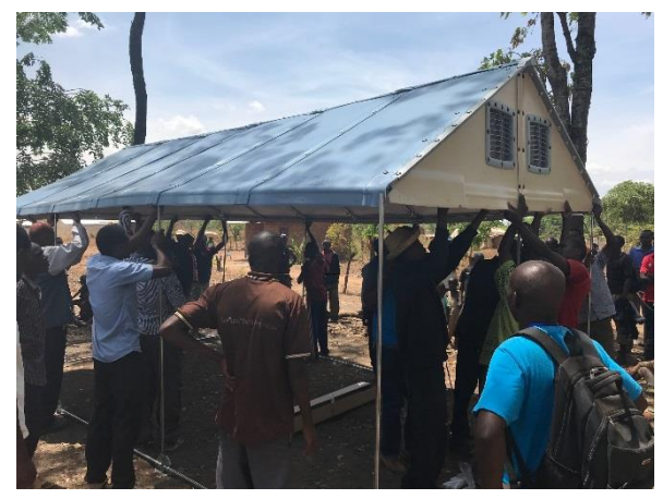
A Refugee Housing Unit being assembled by refugees in Nduta Camp

During the reporting period, a total of 611 transitional shelters were constructed and 86 Refugee Housing Units assembled in Nduta, Mtendeli and Nyarugusu camps, bringing the total number of shelters constructed since January 2018 to 1,757 out of the planned target of 4,605. The available funds for transitional shelters can only cover up to 57% of the overall Burundian refugee population. Refugee Housing Units are innovative temporary shelter solutions, which offer refugees more protection and security.