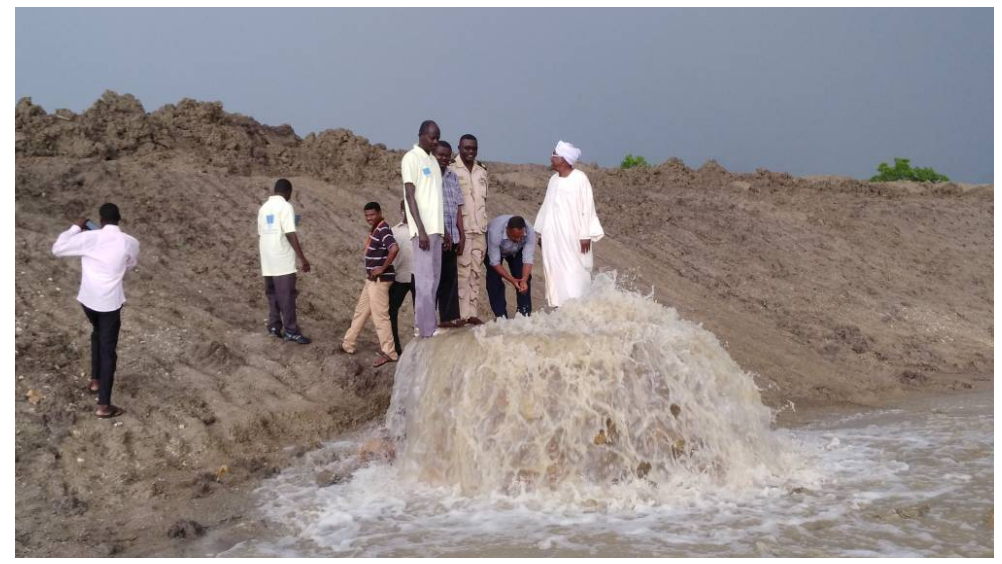
CIS, UNHCR, COR and local authorities observe a test of the new haffir in El Leri, South Kordofan, as part of CIS' WASH initiatives to support peaceful coexistence between refugee and host communities.