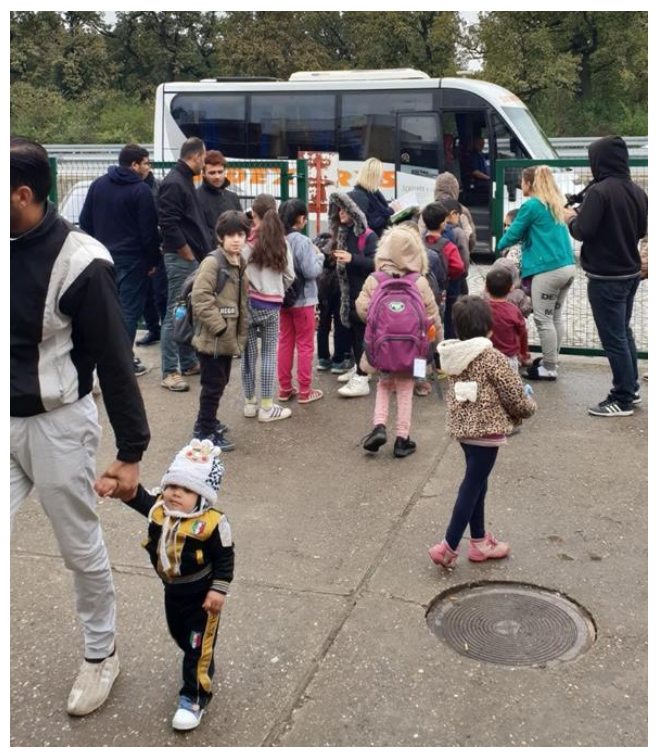
Refugee children from RTC Adasevci boarding the bus to school