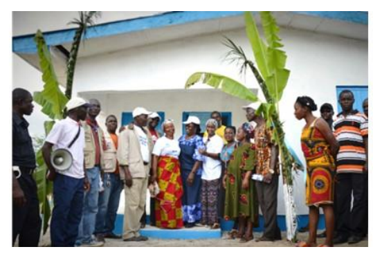
The prototype shelter was inaugurated by RRWA, local and county authorities, refugees and host community.