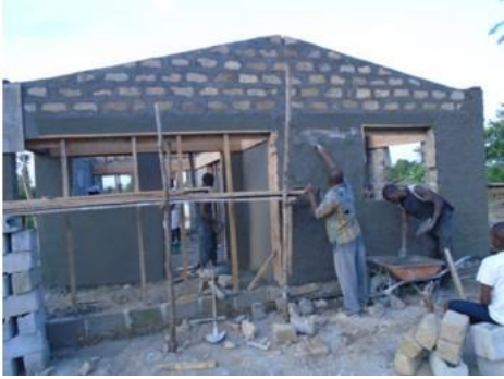
Progress on the construction of the shelter prototype.