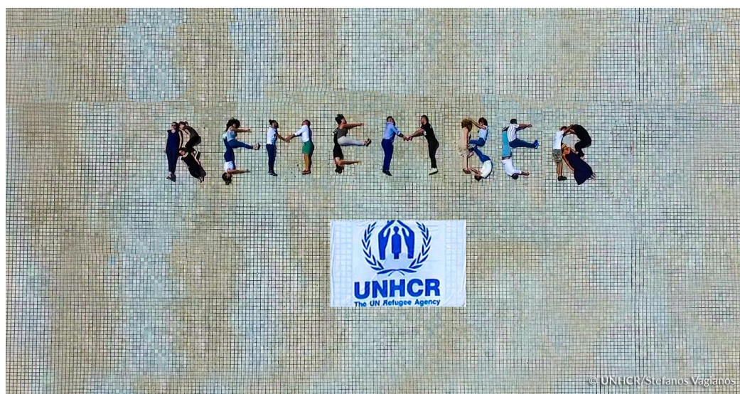
Aid workers and volunteers in Thessaloniki honour World Humanitarian Day on 19 August, paying tribute to aid workers who risk their lives in humanitarian service. Join the #NotATarget movement and demand world leaders to do everything in their power to protect all civilians in conflict.

4 Field Units in Evros, Ioannina, Leros, Rhodes