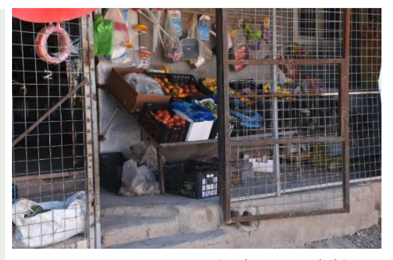
A grocery store in Arbat refugee camp.

The Tech for Food programme expanded in June 2018, with campuses now in Sulaymaniyah, Erbil and Dohuk. In total, 266 students engaged in training, with over USD 4,000 earned from microwork in June 2018.