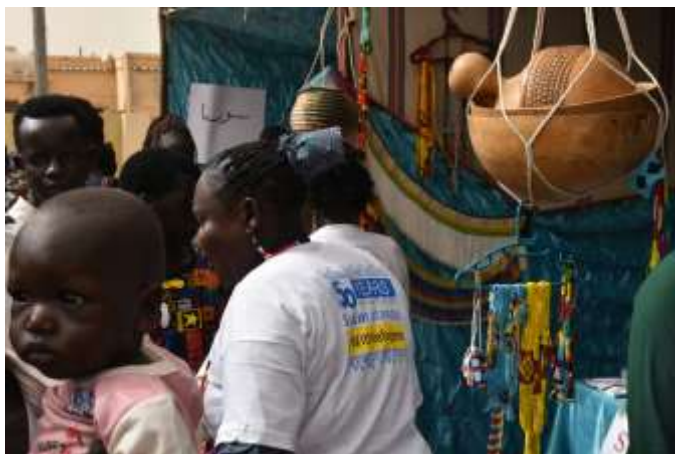
South Sudanese refugee woman sells traditional handicrafts at a stall at As Saha El Shabia stadium in Khartoum during the World Refugee Day celebration on 30 June.