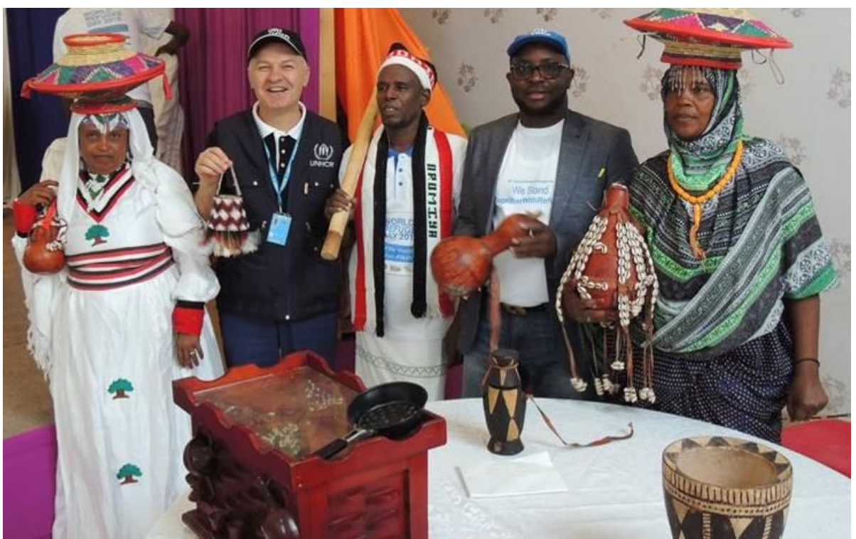
Ethiopian refugees together with UNHCR fostering cohesion, tolerance and community inclusiveness.

speech, he emphasized that the host community in "Somaliland" has a long history of solidarity with refugees and thanked UNHCR and NDRA for the exceptional and constant support extended to refugees, asylum seekers and IDPs.