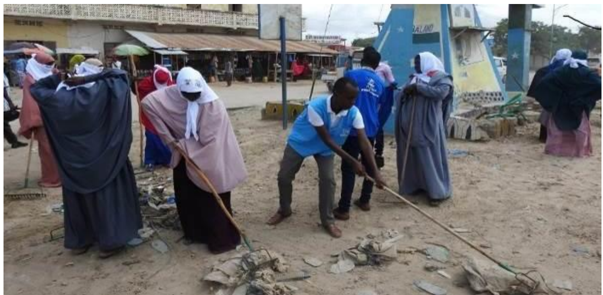
Refugees, IDPs, returnees and the host community beautifying the main road alongside Kismayo Hospital.

World Refugee Day in Kismayo was attended by 180 refugees, returnees, IDPs and members of the host community including representatives of the Jubaland Refugee and IDP Agency (JRIA), the Office of Governor of the Lower Juba region, and the Ministry of Interior After. After the official ceremony, the community, under the leadership of JRIA, cleaned the road along a hospital. Around 100 persons supported the initiative.