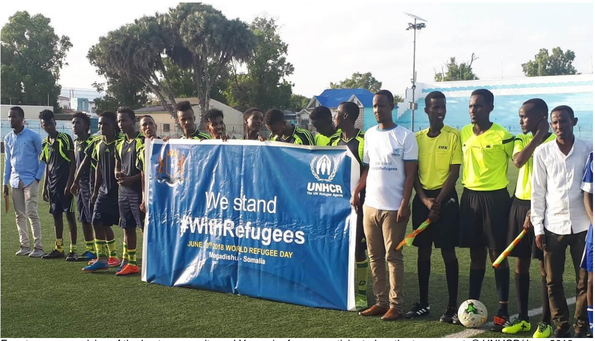
Four teams comprising of the host community and Yemeni refugees participated on the tournament. © UNHCR/June 2018

In Mogadishu, UNHCR organized a workshop on Sexual and Gender-based Violence (SGBV) prevention and a football tournament. The three-day long tournament between the refugees to foster cohesion, tolerance, inclusiveness and peaceful community coexistence among refugees and the host communities.