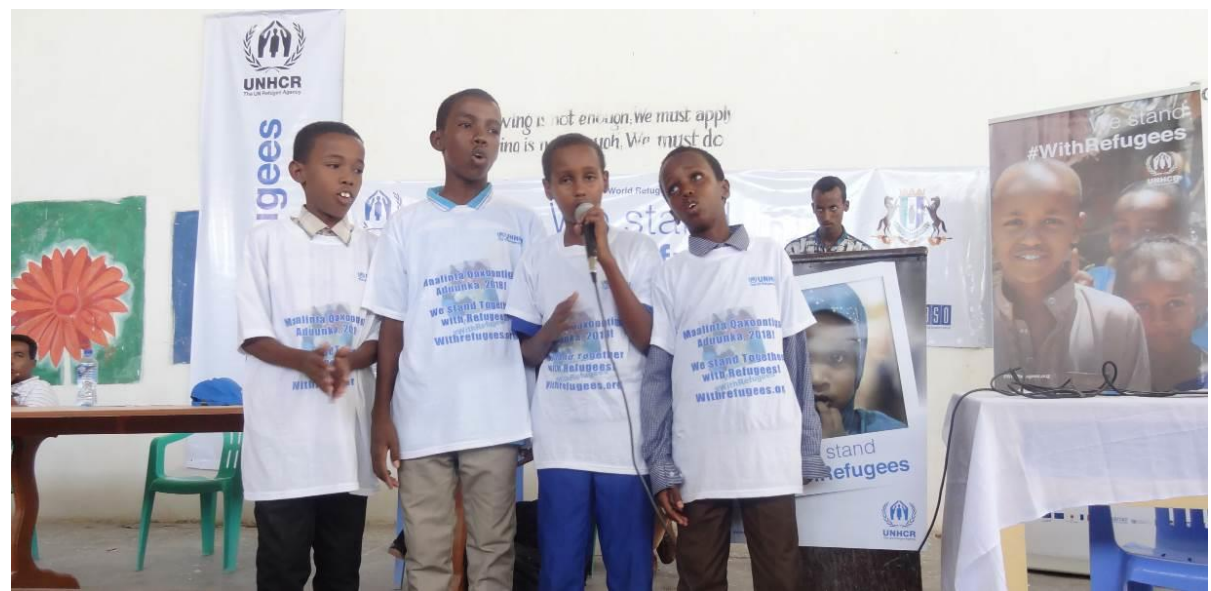
A winning team reciting a poem after winning the competition.

In Galkayo, UNHCR organized a workshop on protection refugees in urban settings and raising awareness on World Refugee Day, a football tournament, a poetry, drama and dance competition, and distributed solar lamps. Around 100 persons participated in the celebration of World Refugee Day, including government officials and UNHCR partners.