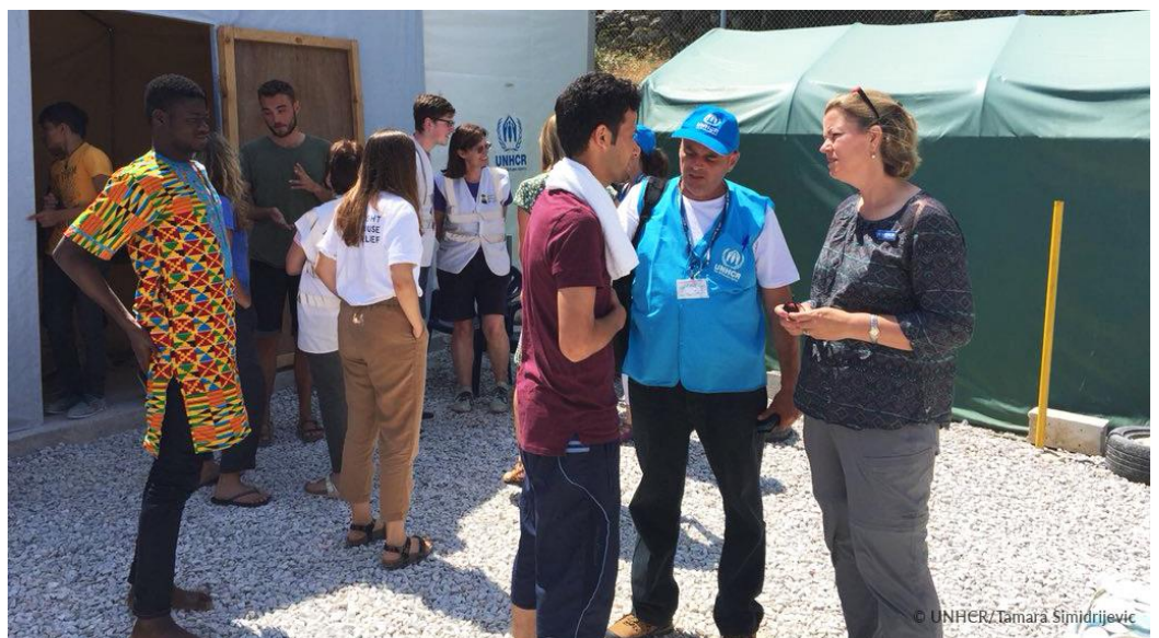
UN Deputy High Commissioner for Refugees Kelly T. Clements meets new arrivals at UNHCR's transit site in the North of Lesbos Island