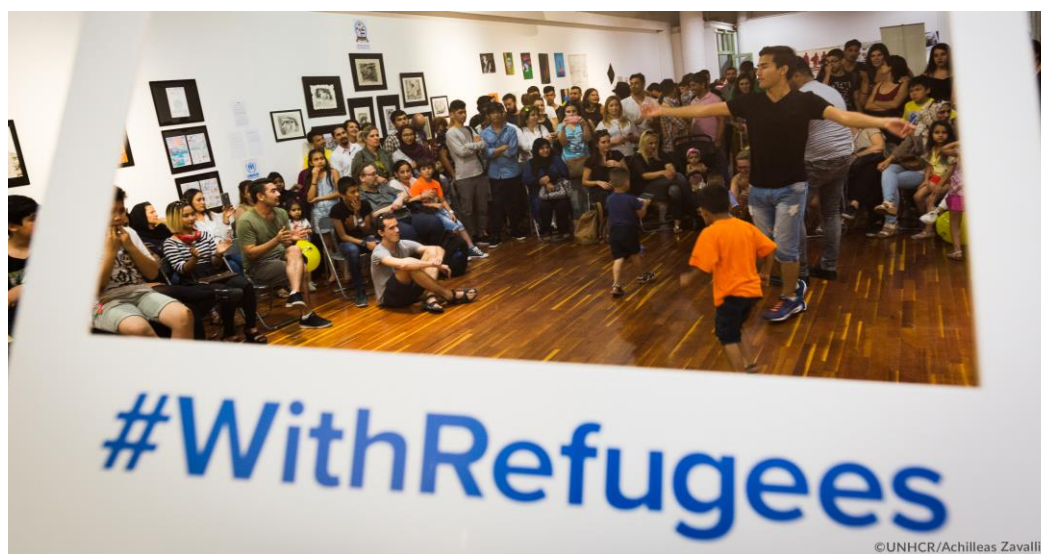
Refugee communities, UNHCR and partner organisations commemorated World Refugee Day in a festival in Technopolis of the Athens Municipality on 20 June.

6 Island Offices in Lesbos, Chios, Samos, Leros, Kos, Rhodes